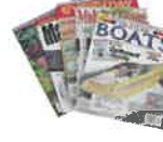
Magazines & Catalogs