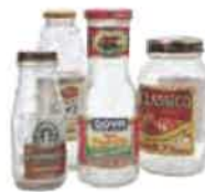
Clear Bottles & Jars