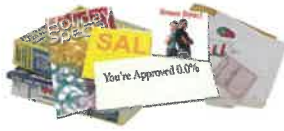
Office Paper, Phone Books Paper Bags & Junk Mail