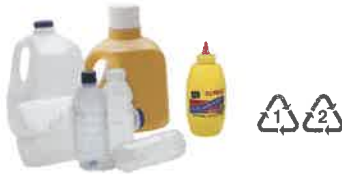
Jugs & Bottles with Small Top Openings