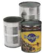
Steel & Tin Cans